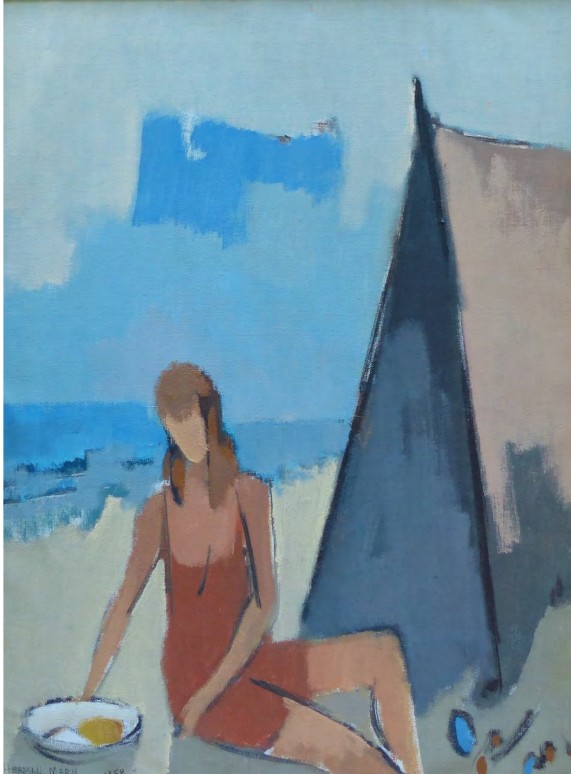
Esta at the Beach