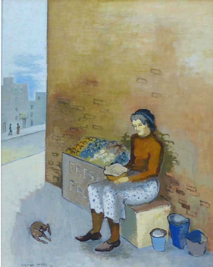
Street in the City Oil on board, 30" x 24", 1940