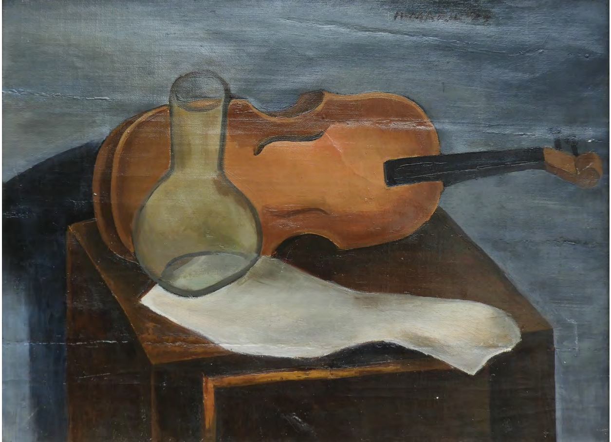
Violin at Rest