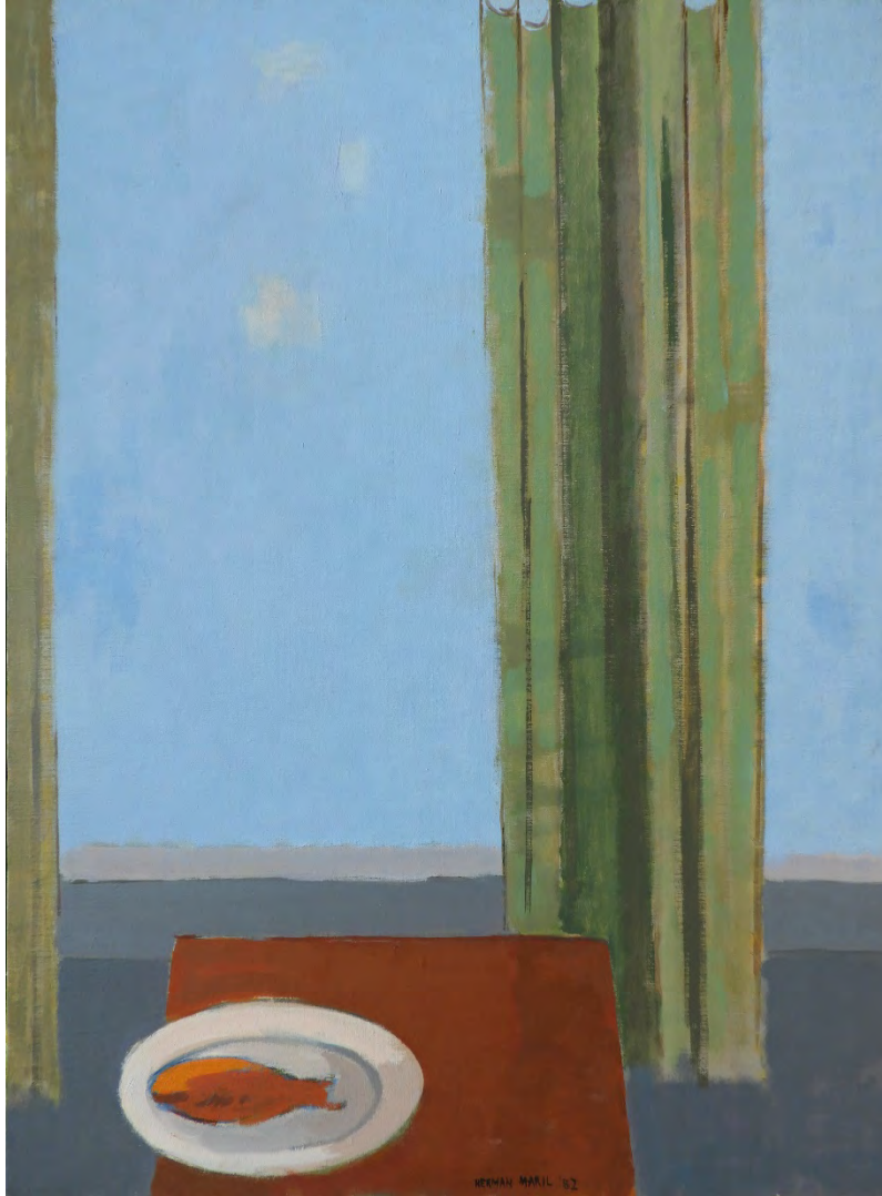
Still Life with Fish