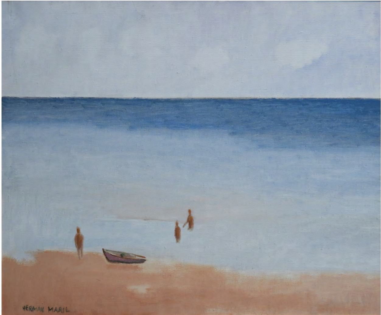
Cape Cod Bathers