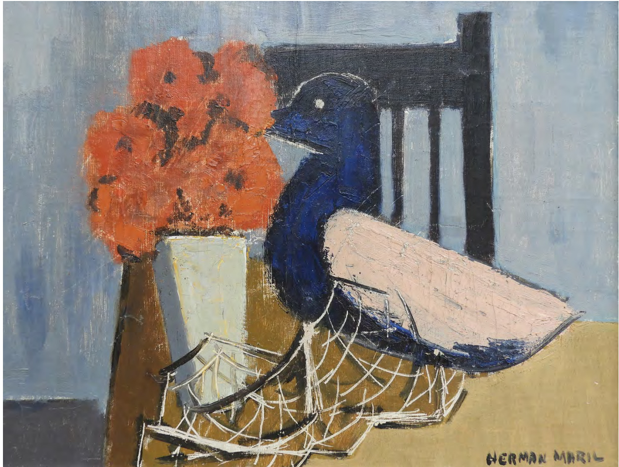
Duck Decoy and Flowers Oil on canvas, 14" x 18 ¼", 1958