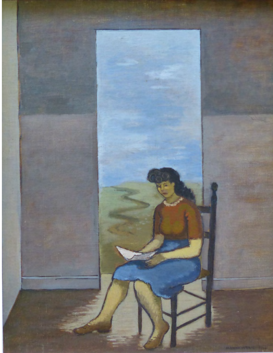
Pensive Young Girl oil on panel, 30" x 24", 1940