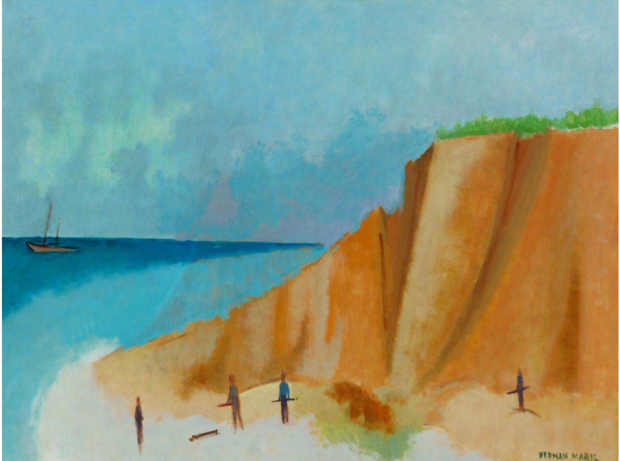
Sunset on Cape Cod Oil on canvas, 30" x 40", 1985