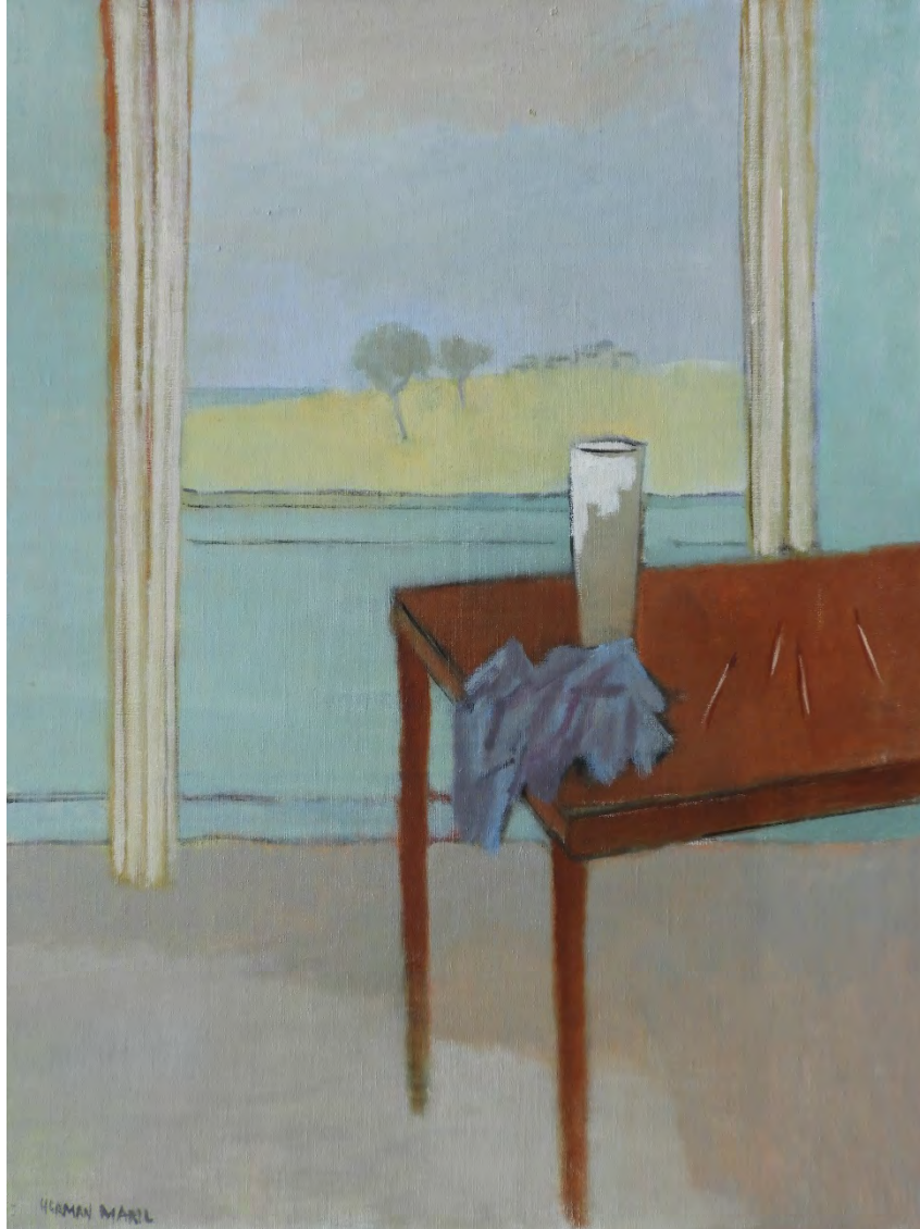
Studio and Window Oil on canvas, 40" x 30", 1952