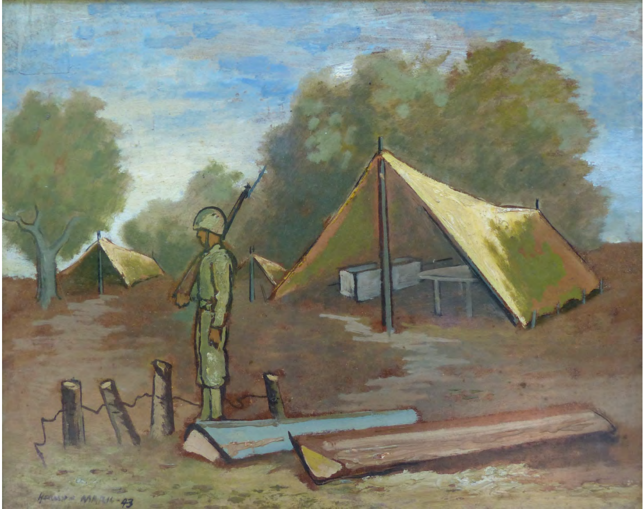
Sentry at the CP Oil on Board, 16" x22", 1943