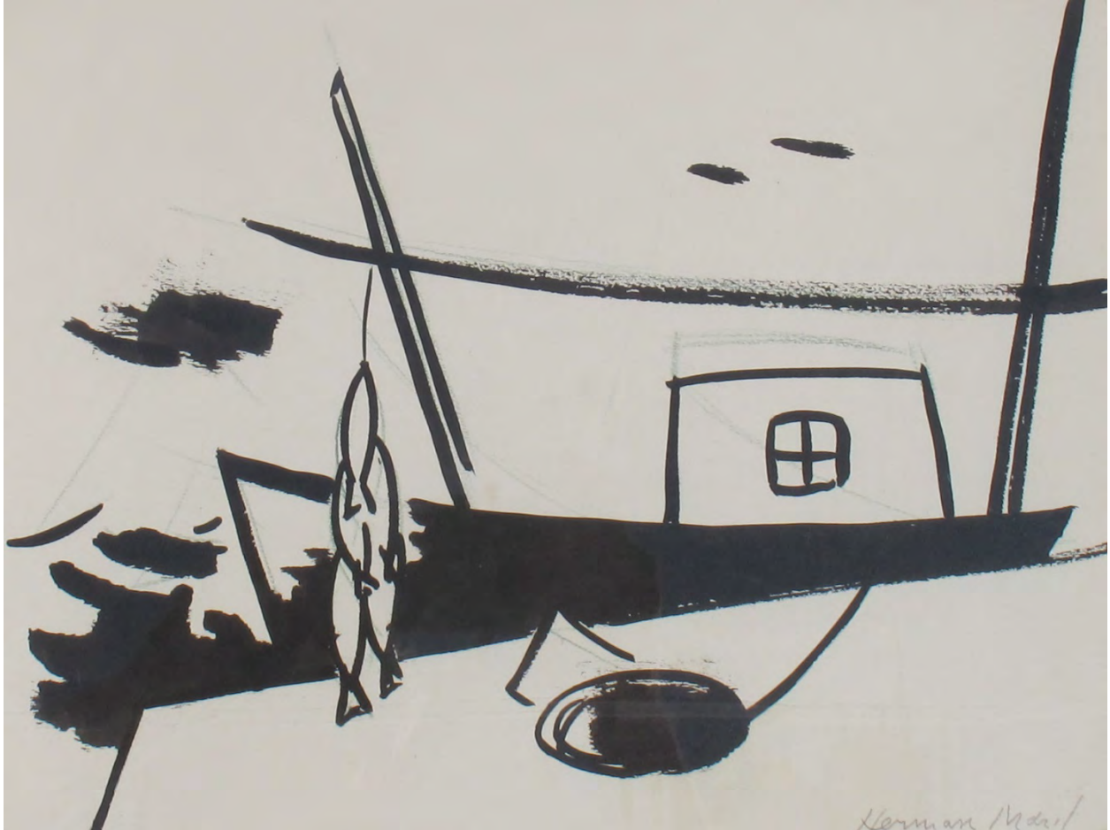
Days Catch Ink, 9" x12", 1970