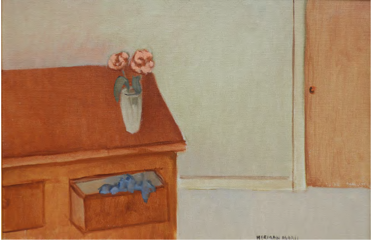
Rose and Open Drawer Oil on canvas, 20" x 30", 1982