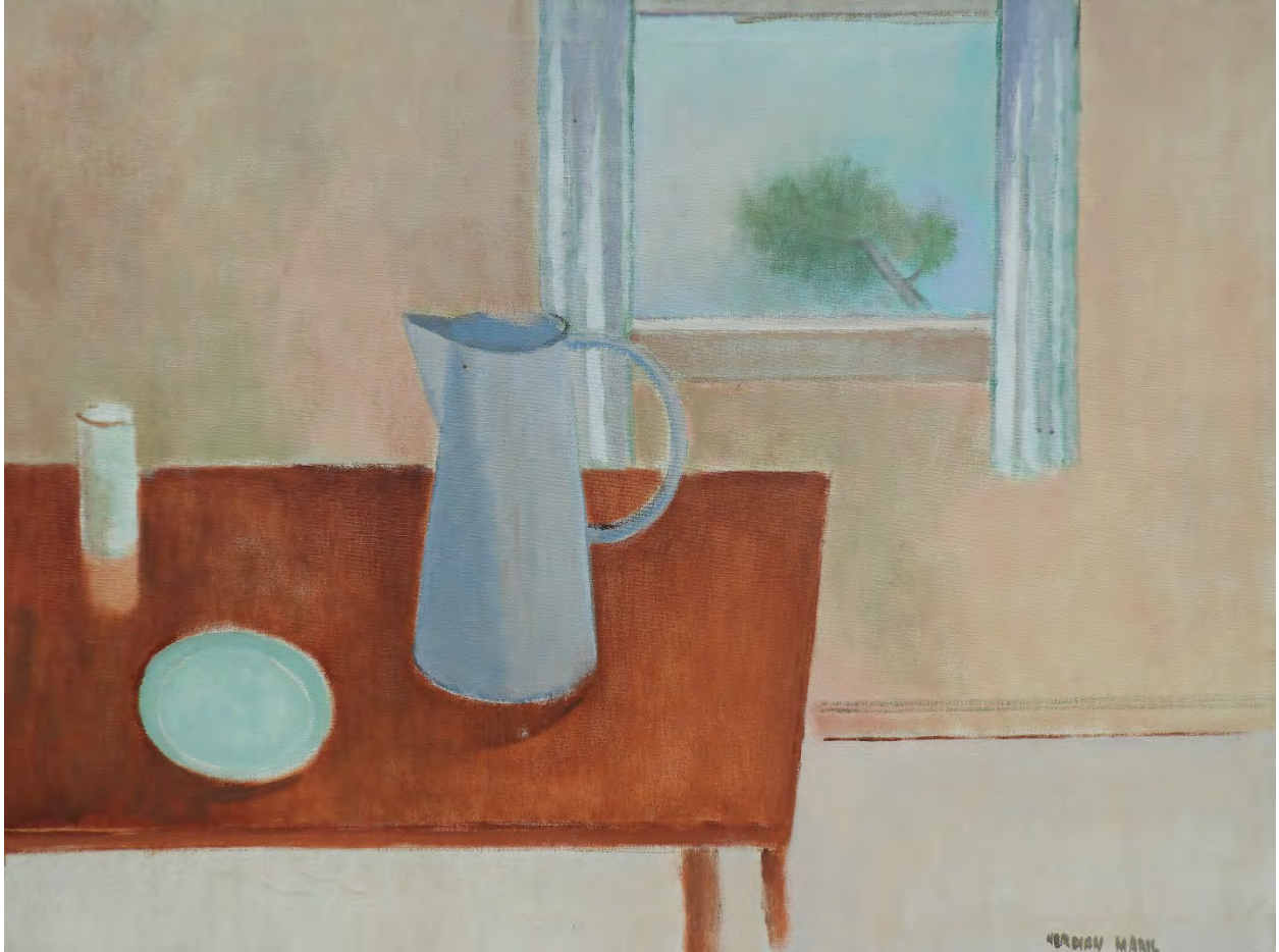
Window and Big Pitcher Oil on canvas, 30" x 40", 1985