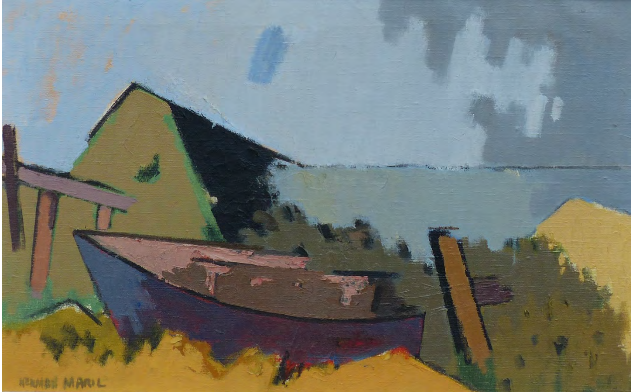
Boat, Sand, and Water Oil on canvas, 16" x 24", 1952