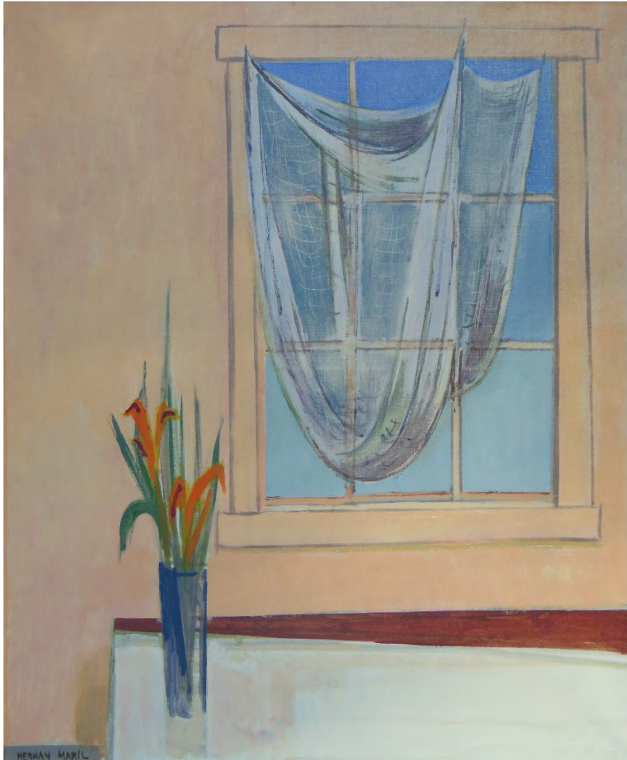
Tiger Lilies and Net Oil on canvas, 38" x 31", 1982