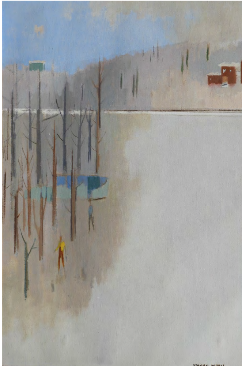
Near Penny Hill