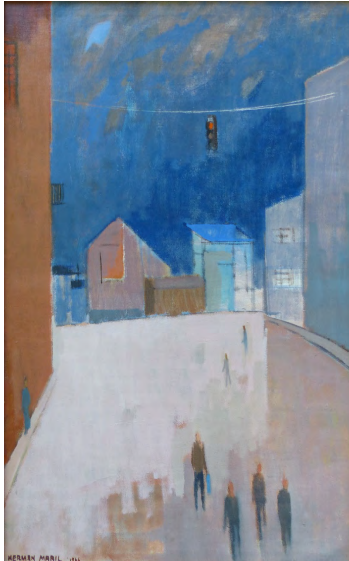
Early Morning Verticals Oil on canvas, 48" x 30", 1966