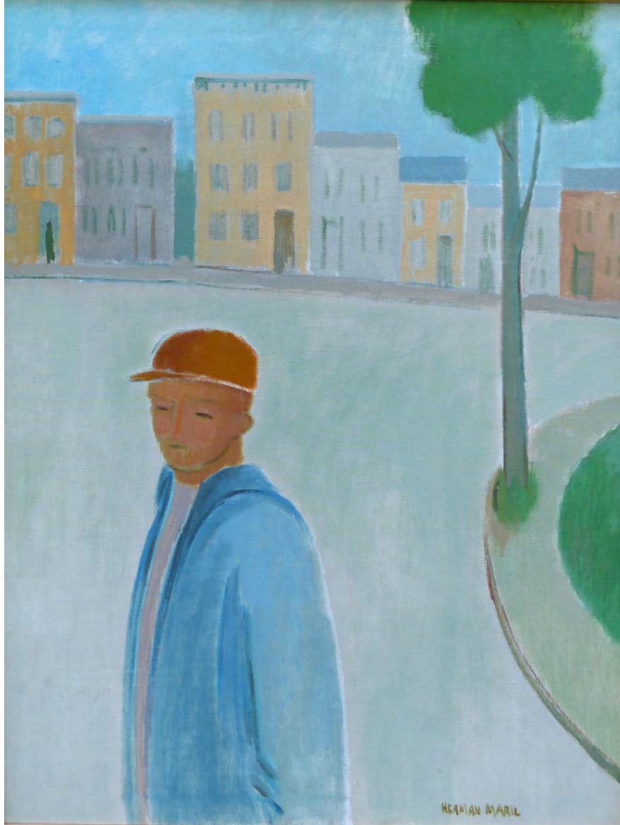
Baltimore Hardhat Oil on canvas, 36" x 28", 1985