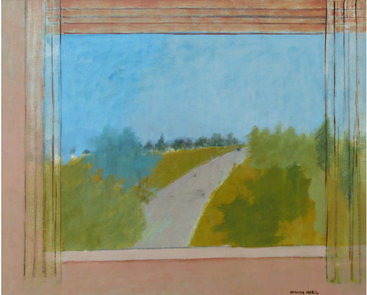
Through the Window Oil on canvas, 24" x 30", 1979